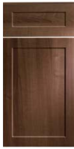
SHAKER Copa Cabana