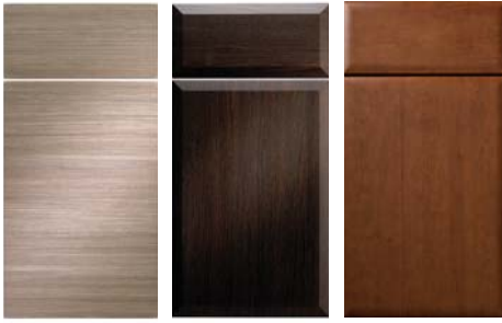
ELEGANTE II Dunbar NOVARA Shadow Oak ITALIA II Cherry Blossom