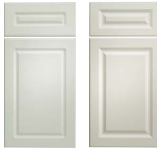
2 PASS Ontario White 3 PASS Ontario White